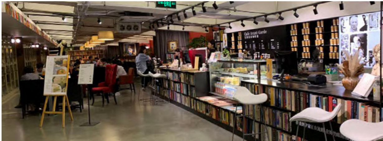
Librairie Avant Garde, Nanjing