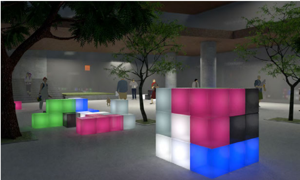
UABBHK-2017-Arts Centre Installation render

Through the cases of Malaysia, Nanjing, Suzhou , and Hong Kong, the author argues that their occurrence could not be coincidental but instead they bear same witness for a paradigm shift in how architecture and urban design strives to serve society and people better by way of flexible, sharing, proactive, and engaging programs and space usage. The idea of space sharing, free-space and community space have overtaken the preoccupation with a distinction of what is private versus what is public (space). However, as shown in these cases, blurred definitions, hybridized activities and user experience in the era of the new generation does not