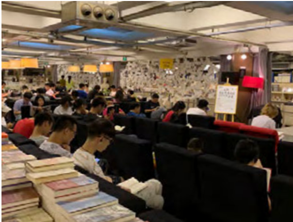
Librairie Avant Garde, Nanjing

Although the third event tells of a transient event happened in 2017 in Hong Kong, it nevertheless marks the unfolding of the city's open arm towards participatory art for the people, in this case as a response to a regional campaign – the Bi-City Biennale of Urbanism \ Architecture (HK). The Biennale is hosted by the cities (municipality) of Shenzhen and Hong Kong SAR. For the author, the 2017 event was a turning point for Hong Kong as it approved a bold mission to engage the people and the city at large, in order for everyone to engage with arts. The organizer and the curatorial team have been successful to gain supports from both the public and private stakeholders for the 2-6 months event. In this case, various government agencies as well as private agencies (for example, professional societies and institutes, private real estate developers, and building owners) have unconditionally bought into the curatorial team's proposal to engage the public on a daily basis by the conversion of a number of private spaces