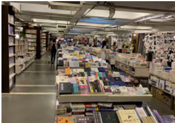
Librairie Avant Garde, Nanjing

amid threats of extinction due to the popularity of knowledge on-line in lieu of books as physical entity. This example has been construed by two real life events, one being the Xinfeng Bookstore Nanjing and the other being the Es-lite Bookstore Suzhou. Despite a remarkable distinction because of scale, size, resource, operational mode and experience, they tell of a similar rebirth of bookstore which exhibit a